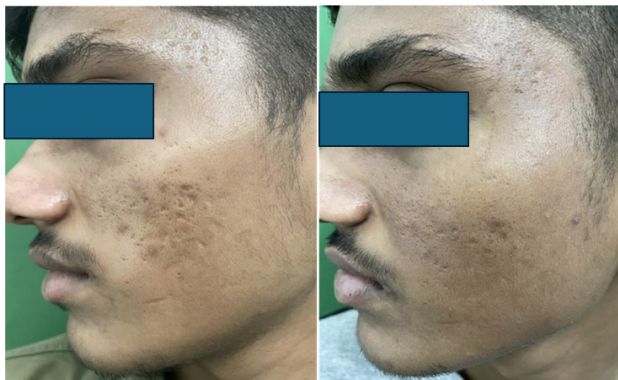
First Visit (Pre)