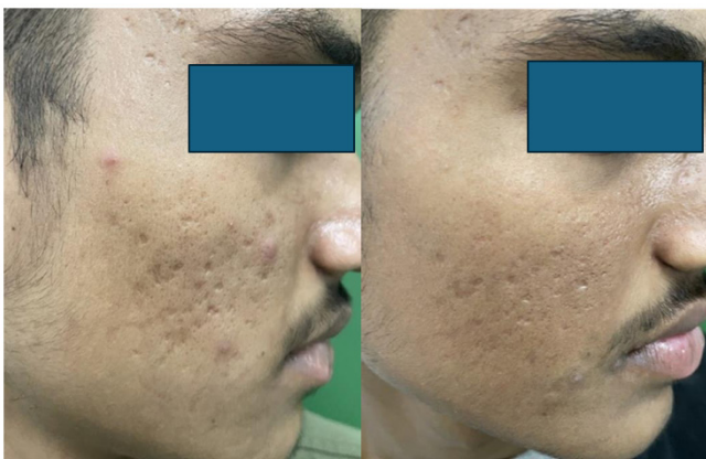
Figure 3: Microneedling radiofrequency pre and post (right side)

the two devices. It appears, nonetheless, that numerous therapy sessions are necessary to attain a level of clinical improvement that is adequate. While many studies have shown that acne scars become less noticeable after using MNRF and EL1550 nm devices, these two modalities have not been compared on the same patient.